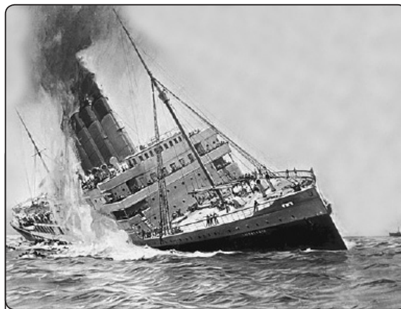
The Sinking of the Lusitania. She was a British cargo and passenger ship.

(a) The Lusitania was a British cargo and passenger ship that was torpedoed and sunk due to German submarine activity in May 1915, less than ten years after she began her trans-Atlantic journeys. The Lusitania's construction began in September 1904, and she went to sea approximately two years later on June 7, 1906. She was used to ferry goods and people between England and the United States. The Lusitania was very popular because of her speed and luxurious accommodation.